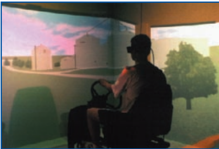
FIGURE 4. Testing a prototype tractor in the VE led to an important design change.

beginning to be used in areas such as virtual training and operator qualification. 9