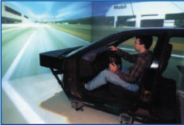
FIGURE 3. A VE being used to test the safety of a new car design.