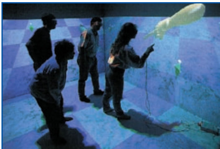
FIGURE 1. C2 surround-screen virtual reality display.

Recent uses of VEs indicate the range of possibilities and some of the challenges involved in using VEs for certification. Certification is a process whereby a certification authority determines if an applicant provides sufficient evidence concerning the means